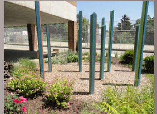
PHS award-winning natural playspaces at Weil (left) and Carmalt (right)

The PHS Community Greening Award is an annual recognition that acknowledges greening and beautification projects that benefit communities throughout the mid-Atlantic region. PHS judges rated each green space on plant variety, design, use of space and horticultural practices. Each winning school received a certificate and an honorary sign to place in the green space.