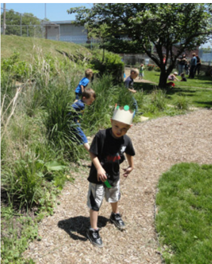
Students explore their new natural playspace at Roosevelt Primary (PreK-1)

WPC School Grounds Greening Project brings children closer to nature by enhancing the grounds of Pittsburgh Public Schools with greenery and outdoor green spaces. A partnership of the Western Pennsylvania Conservancy, the Grable Foundation and Pittsburgh Public Schools, this project will bring low-maintenance, sustainable greenery to all Pittsburgh Public Schools by 2012.