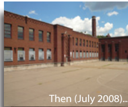
Then (July 2008)...