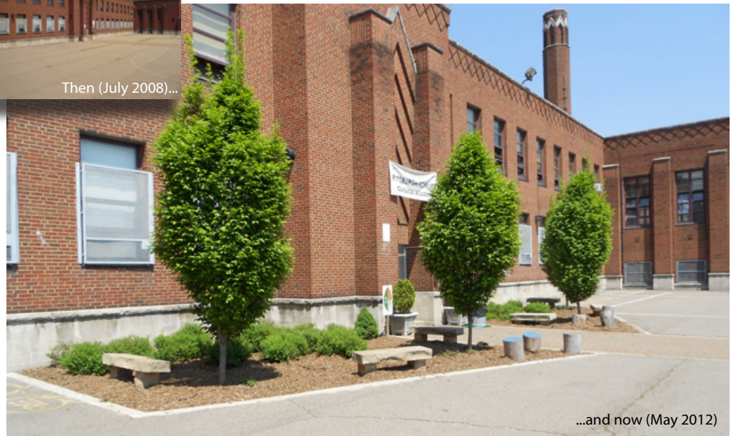
...and now (May 2012)